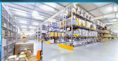
DRY INDUSTRIAL ENVIRONMENTS

With its revolutionary design, the VECTOTHOR MERLIN 100E is recommended for use in shops and restaurants and dry industrial environments. The unit can be mounted in multiple positions onto the wall or the ceiling.